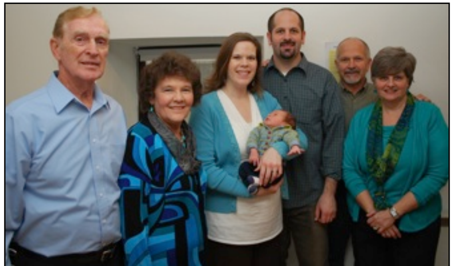
(Above) Both sets of our parents here to see their grandson. What a blessing to have parents that love US, JESUS AND THE HARVEST so much. We would not be here without them.