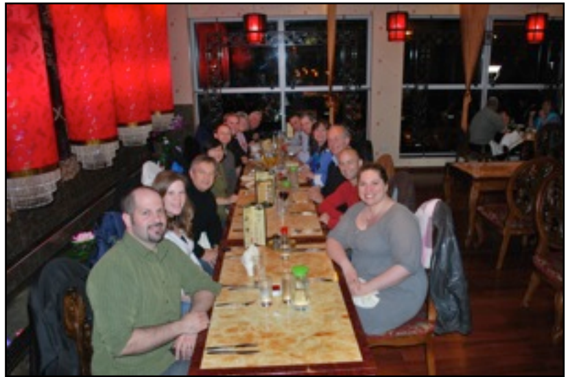
(Above) Horizon Leaders in from Europe eating dinner at "Kong Fuzi."

This past week we had 30 non-church teens come to the Drop, our youth outreach! God is opening doors into the youth of Ireland for what He has in store for the future. Pray that many will open their heart to Christ and get involved in Church in 2012. (Right) teens play X-Box on projection screen and hang out and chat with us downstairs.