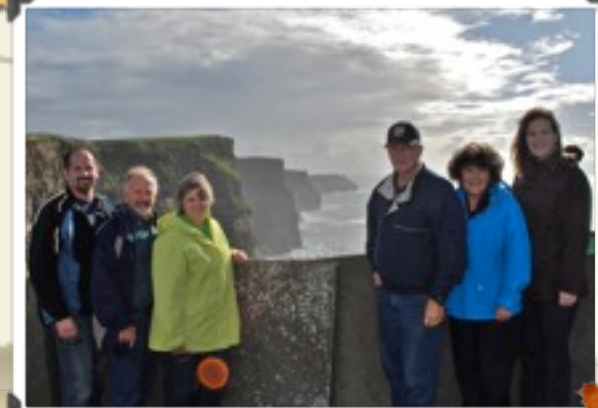
Special memories made when our parents visited in August! Above - Cliffs of Moher.